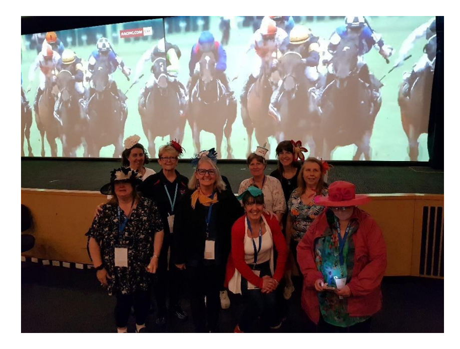
It's glammed up time during Melbourne Cup Day